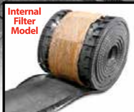
Internal Filter Model